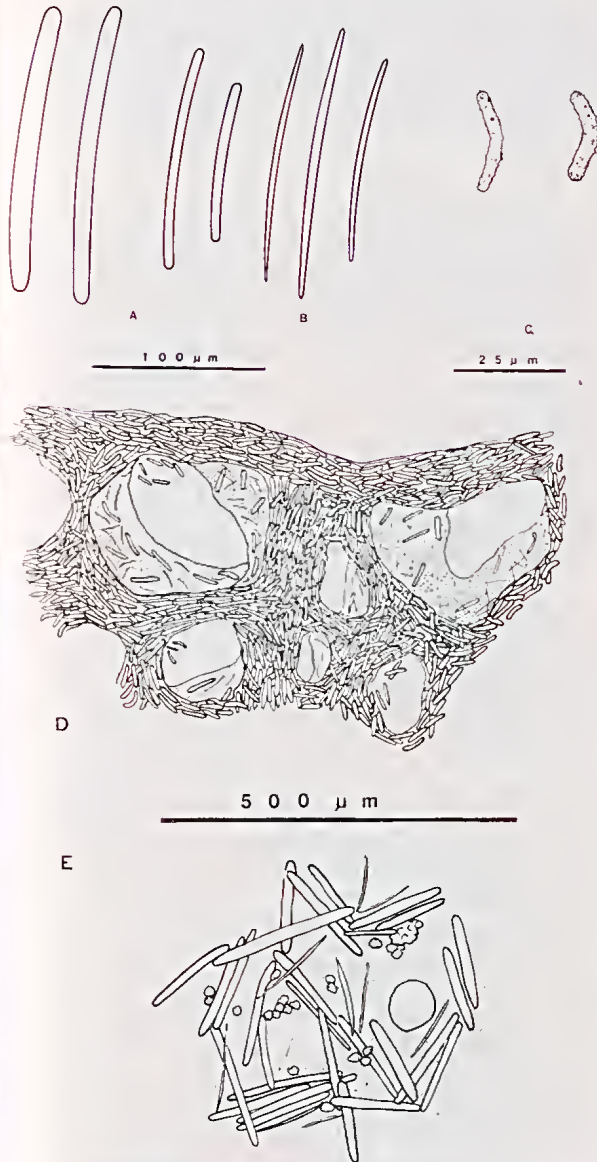
Fig. 4— Acanthostrongylophora ashmorica gen. et sp. nov. skeletal components. A, strongyles. B, oxeas. C, microstrongyles; skeletal architecture. D, perpendicular section of peripheral skeleton. E, tangential view of ectosomal skeleton.

(NTMZ1495, Z.M.A. fragments of holotype) from north of Barracouta Shoals, Ashmore Reef, Timor Sea, Western Australia, lat. 12^{\circ} 18' - 19'S , long. 124^{\circ} 04' - 06'E ; Coll. C. C. Lu, R.V. Hai Kung , station no. 70033105, trawl, 80-91 m depth, 31 Mar. 1981. Other Specimens: NTMZ1779 from west of Port Hedland, Western Australia, lat. 19^{\circ} 4.2'S , long. 118^{\circ} 54.0'E , coll. T. Ward, CSIRO R.V. Soela station no. 122, trawl, 82 m depth, 29 Aug. 1983; NTMZ1884 from west of Port Hedland, Western Australia, lat. 19^{\circ} 2.2'S , long. 118^{\circ} 4.1'E , coll. T. Ward, CSIRO R.V. Soela station